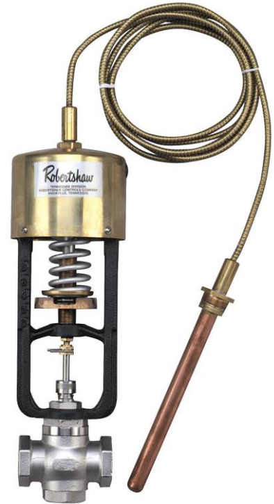
Size: 3/4" Connection, 1/2" Port